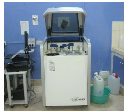
Fig 2: Auto analyser: Trasasia Erba Mannheim XL-640