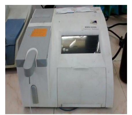
Fig-3: Semi auto analyser: Agapee Mispa Excel Chemistry