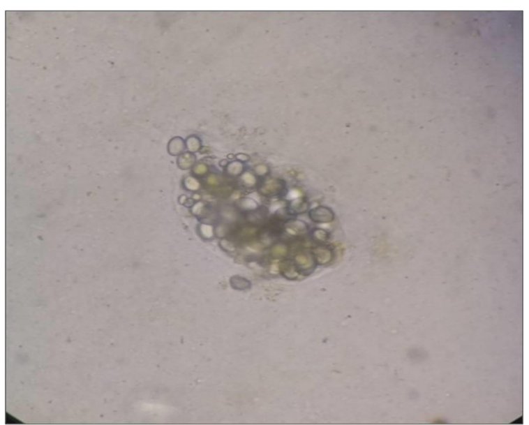
Fig 2: Microscopic examination showing eggs surrounded by a thin membrane. [Wet preparation x 40]