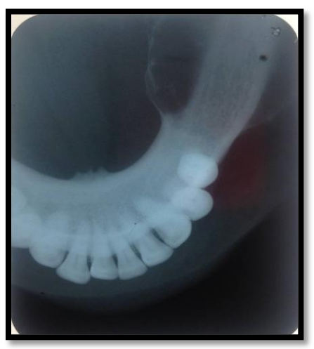
Fig 4: Occlusal Radiograph