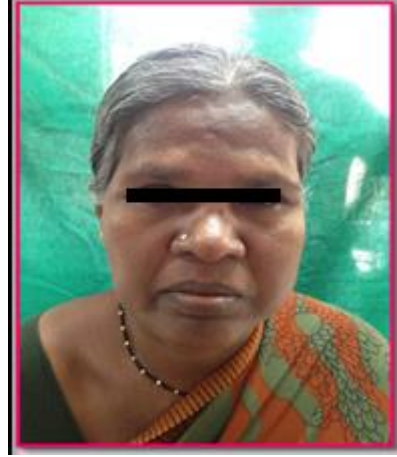
Fig 1: Profile

and radiological findings, a diagnosis of granular cell ameloblastoma was established.