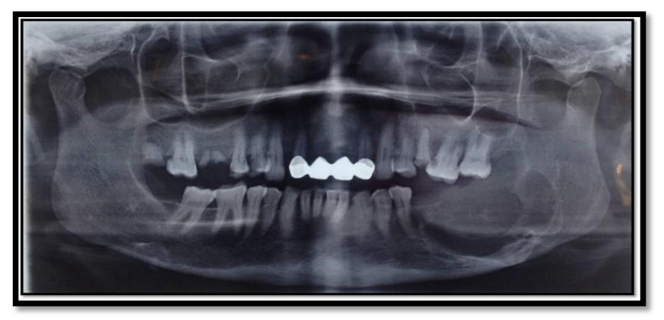
Fig 5: OPG