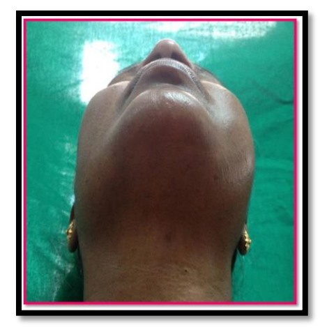
Fig 2: ExtraOral