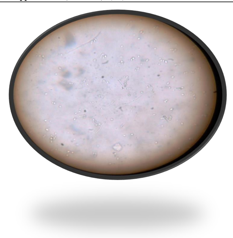
Fig-1: Germ tube test.