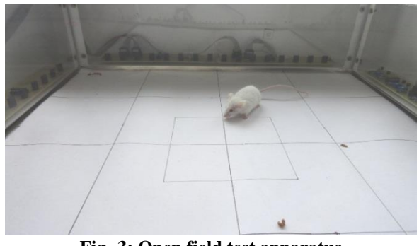
Fig-3: Open field test apparatus

surrounding it to give meaning to the central location as being distinct from the outer locations.