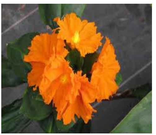
Fig-1: Flowers of Chamaecostus cuspidatus

brazil (states of bahia&spiritosanto) in India it is known as insulin plant due to its antidiabetic property[3]. This plant belongs to the family costaceae which was first raised to the rank of family by Nakai on the basis of spirally arranged leaves &rhizome being free from aromatic essential oils. This family consists of 4genera &approximately 200 species. The genus costus is the largest family because it is having 150 species [4].