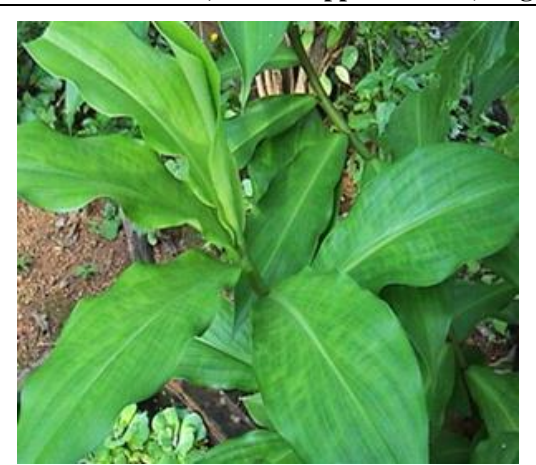
Fig-2 Leaves of Chamaecostus cuspidatus