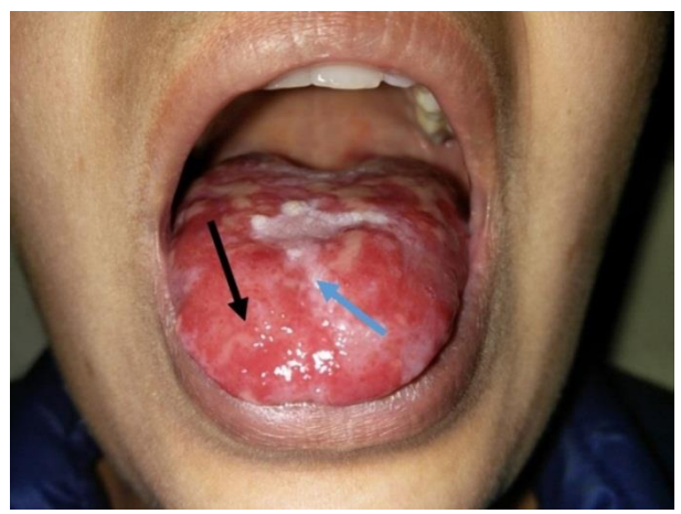
Fig-3: After three weeks of treatment erosions are reduced

Findings were consistent with Oral Lichen planus. Patient was started on topical steroids and tacrolimus. Dapsone in a dose of 100 mg was added along with symptomatic local anaesthetic benzocaine. Patient showed improvement at three weeks [Figure 3], topical steroids were discontinued while she was continued on daily dose of Dapsone and topical tacrolimus At 6 weeksthere was marked improvement as shown in figure (Fig-4).