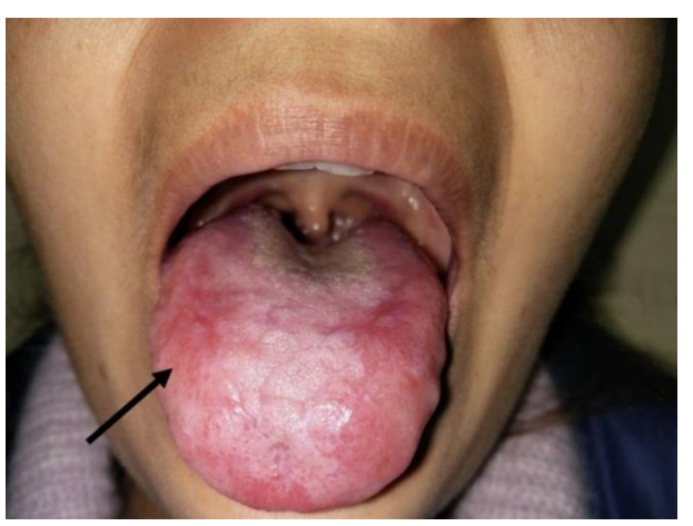
Fig-4: After 6 weeks of treatment black arrow shows only few residual types of erosion