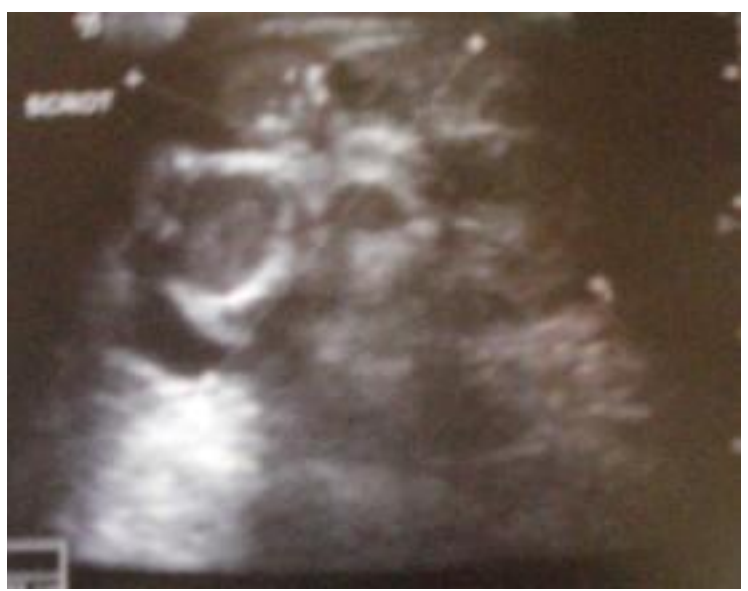
Fig-2: Ultrasound appearance of a testicular tumor in children

The clinical examination found a large bursa in all children with local inflammatory signs in 2 of them. Ultrasonography performed in all patients revealed a heterogeneous hypoechoic tissue mass ranging in size from 28 to 86 mm, central necrosis was present in 2 patients with the presence of intra-testicular calcifications in 4 others (Figure 2).