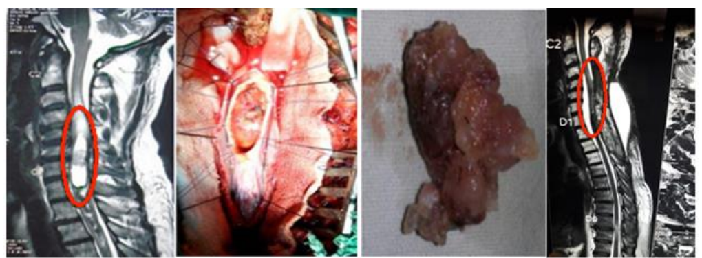
Fig-3: A. A faintly enhancing cervical IMSCT representing an ependymoma. B. An intraoperative photograph after gross total resection of an intramedullary ependymoma shows clean tumor margins without evidence of residual tumor. C. A lobulated, glistening reddish or brownish mass consistent with ependymoma. D. Postoperative image demonstrating a CMR.