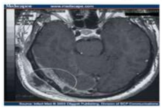
Fig-4: HRCT showing left sided epidural abscess in posterior wall of left petrous bone due to mastoiditis