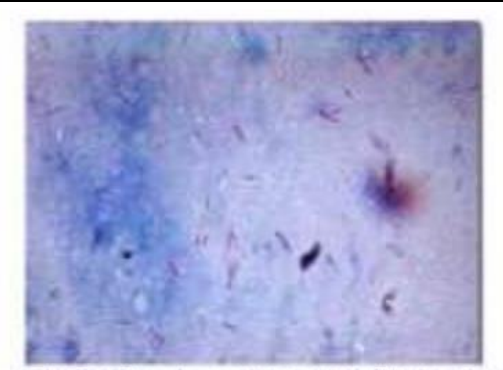
Fig 3: Showing acid fast bacilli in pus sample