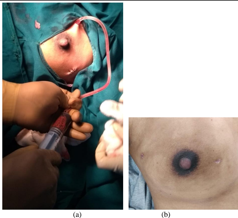
Fig-3: (a) The cavity was flushed with betadine and hydrogen peroxide and the drain tube is connected to a suction apparatus. (b) Scar noted on postoperative day 14