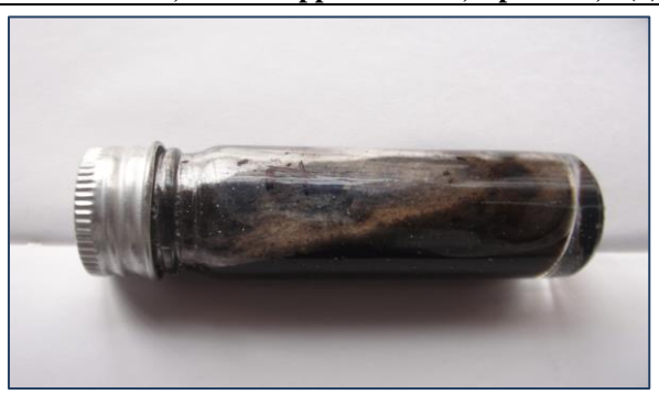
Aspergillus niger on culture media