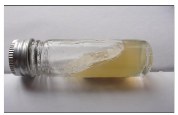
Candida albicans on culture media

species as the second most common. In our study, Candida species were found in 10 patients (13.9%) all of which were Candida albicans.