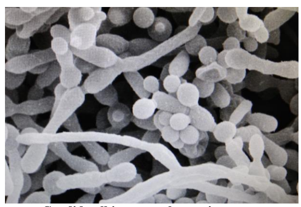
Candida albicans on photo microscopy