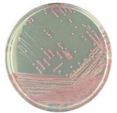
Fig-2: MRSA CHROMAGAR