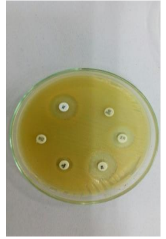
Fig-1: AST SHOWING MRSA