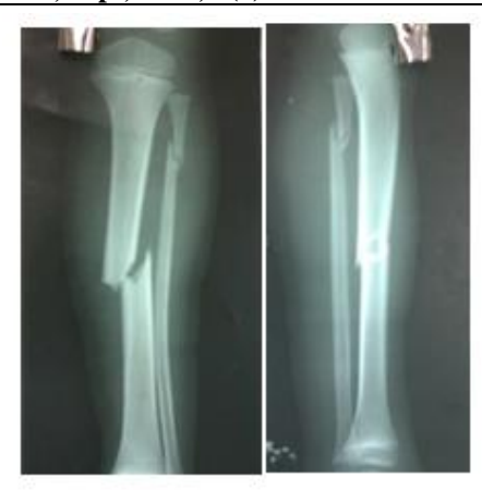
Fig-1: Pre-op x-ray of 7yr male left leg AP and Lateral view