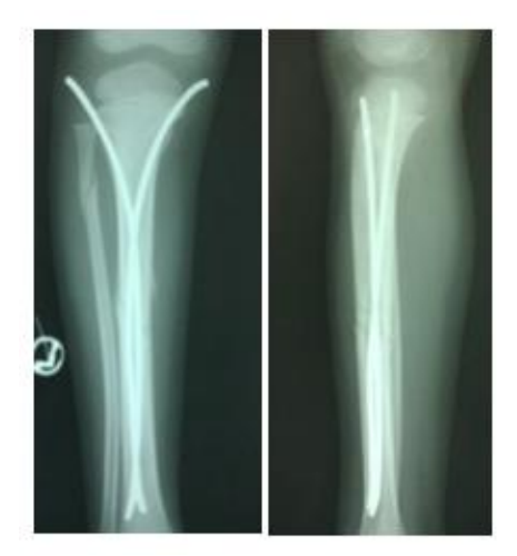
Fig-2: Post-op x-ray of 7yr male left leg AP and Lateral view