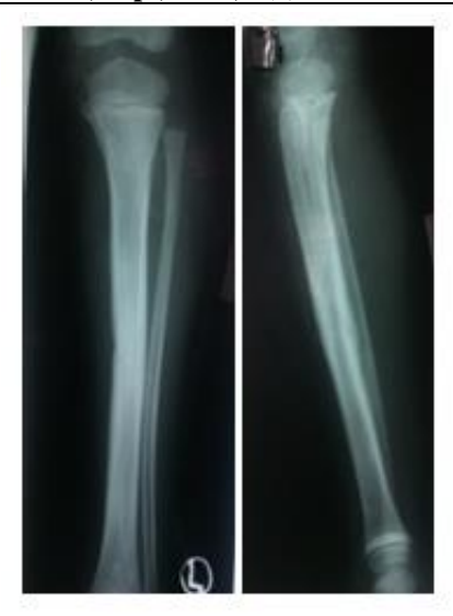
Fig-4: x-ray after nail removal of 7yr male left leg AP and Lateral view