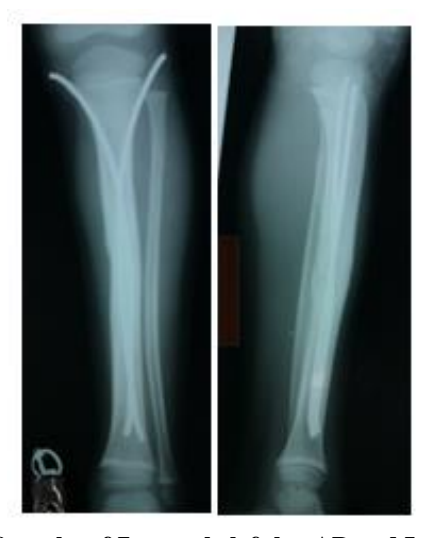
Fig-3: x-ray after 9 weeks of 7 yr male left leg AP and Lateral view