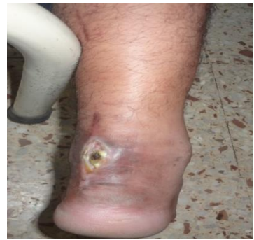
Fig-A: Pre-operative defect