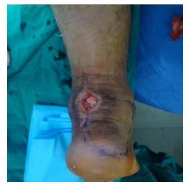
Fig-B: Marking of flap (short flap type)