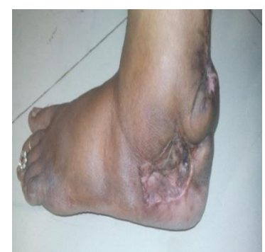
Fig-D: 3 month follow up showing excellent graft take