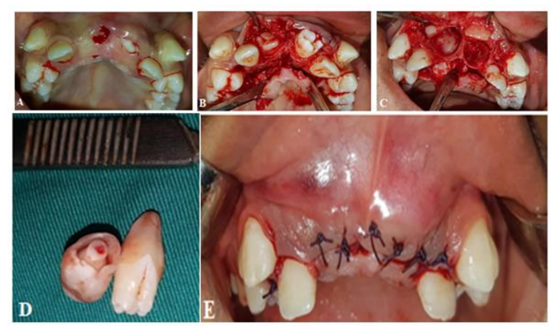
Fig-3: Surgical steps A- Incision from premolar to premolar, B- Palatal discharge, C- After extraction of supernumerary teeth, D- The two supernumerary teeth (Dens in dente), E- After sutures

Post-chirurgical instructions were explained to the patient along a prescription of antibiotic and analgesic treatment. The recall visits were scheduled for the following week to remove suture and evaluate the healing process.