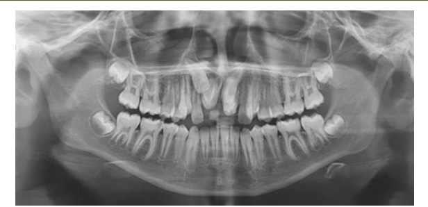
Fig-1: Panoramic radiograph showing the impacted permanent upper central incisors and the presence of two supernumerary teeth