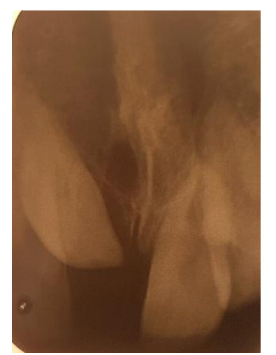
Fig-5: Radiographic follow up (after 9 months)