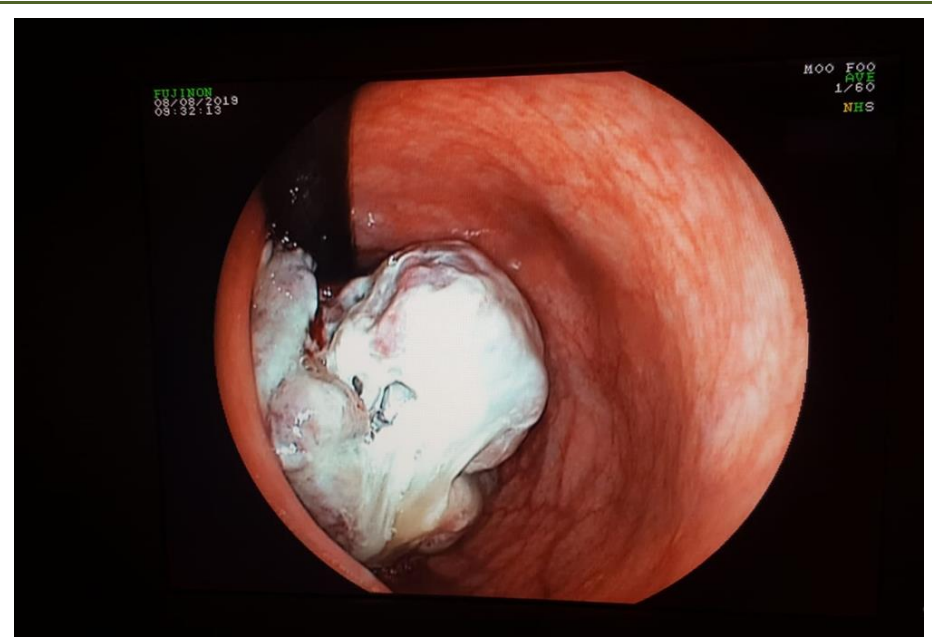
Fig-1: Rectosigmoidoscopy showed at the level of the wall anterior to 01 cm of the anal margin, a budding tumor process extended about 4 cm without internal hemorrhoids

On histopathological examination with immunohistochemical study, the tumor cells were highly positive for HMB-45 and Melan A, thus the diagnosis of melanoma was retained.