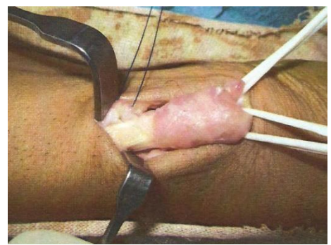
Fig-3: The hypertrophic synovite around the PLA.