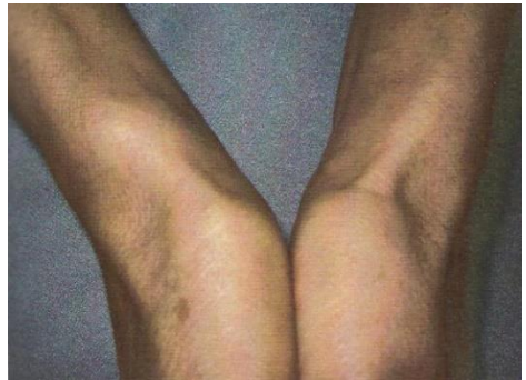
Fig-1: Tumeification of the radial styloid of the right wrist

disappointing in 8 patients, +/- satisfactory in 1 patient. The 10th patient was operated on from the ground because he had a tumefaction downstream of radial styloid that caused a restriction of thumb mobility. Synovectomy was performed in 8 patients and anatomical abnormalities (a sagittal septum, duplicated APL tendon) were recovered in the other 2 patients. The post-operative outcome was satisfactory and evolution was very good without recurrence in all 10 patients.