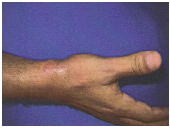
Fig-8: Post-operative result (no palm-to-abduction luxation)