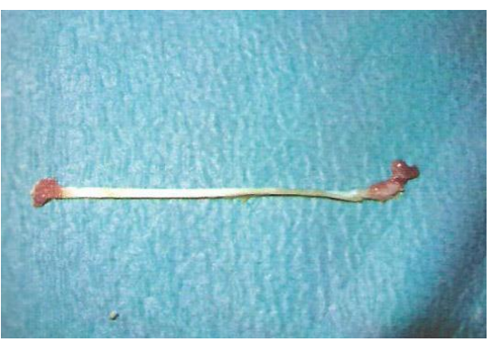
Fig-7: The supernumeric APL tendon after resection (interposed between two carnus bodies)