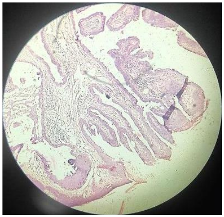
Fig-4: Histopathology showing glandular papillary proliferation connected to skin surface

Case 4: A 28 year old male patient presented with well defined, verrucous plaques of size 3x 4 cm over right parietal region of scalp. As per the history, the lesion was present since birth as yellow- orange, velvety plaque of size 1x2 cm. It had rapidly increased in size, grew thicker in past 10 years. A diagnosis of post pubertal nevus sebaceous was made. Patient came for excision for cosmetic purposes and excision biopsy was done. Biopsy findings were suggestive of nevus sebaceous of Jadassohn.