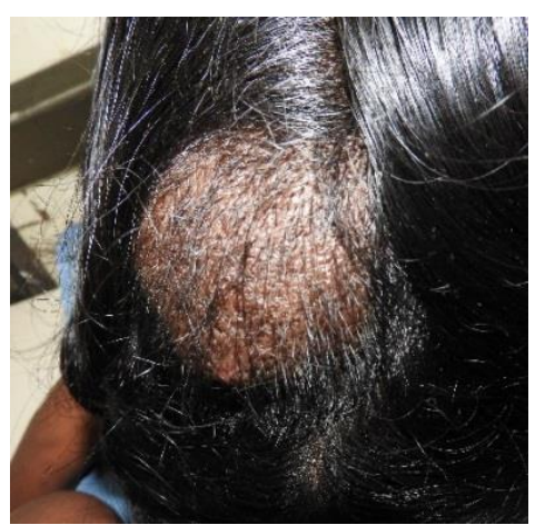
Fig-2: 4x 5 cm sized well defined skin colored nodule over occipital area of scalp

Case 2: A 20 year old male patient of pemphigus vulgaris presented with single asymptomatic well defined, nodular lesion sized 4x 5 cm on scalp. Patient noticed the lesion since 1 year. The lesion was firm in consistency and was skin colored.