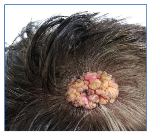
Fig-6: 2x2 cm sized skin colored, well defined, verrucous, nodule over parietal area of scalp

Case 6: A 14 old year male patient presented with single asymptomatic lesion over occipital area of scalp, present since birth. The lesion was flat initially; it increased in size in past few months to develop into a verrucous, firm nodule 1x2 cm in size.