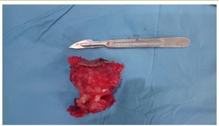
Fig-5: The tumor after exeresis