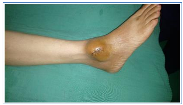
Fig-1: Preoperative image