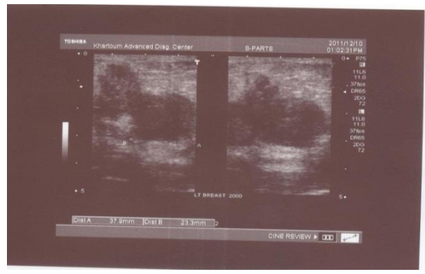
Image-1: breast ultrasound image of 65 years old female showed irregular, hypoechoic mass located in the left UOQ at 2:00 o'clock measured 3.8x2.3cm; the diagnosis was invasive ductal adenocarcinoma

The study found that the prevalence of breast masses (benign and malignant) 22%, 4.4% for malignant and 17.5% for benign, the most common malignant is IDC and the most common benign are fibroadenomas. The sonographic features of IDC mostly hypoecoic, irregular, ill-defined and have AP to width ratio> 1 and the sonographic features of fibroadenoma are mostly hypoechoic, oval, well defined and have AP \width ratio <1.