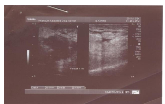
Image-3: Breast ultrasound image of 56 years old female showed irregular shape, hypoechoic mass with ill-defined margins and oedema located in the right LOQ at 7:00 o'clock measured 2.6x2cm, the diagnosis was ductal adenocarcinoma