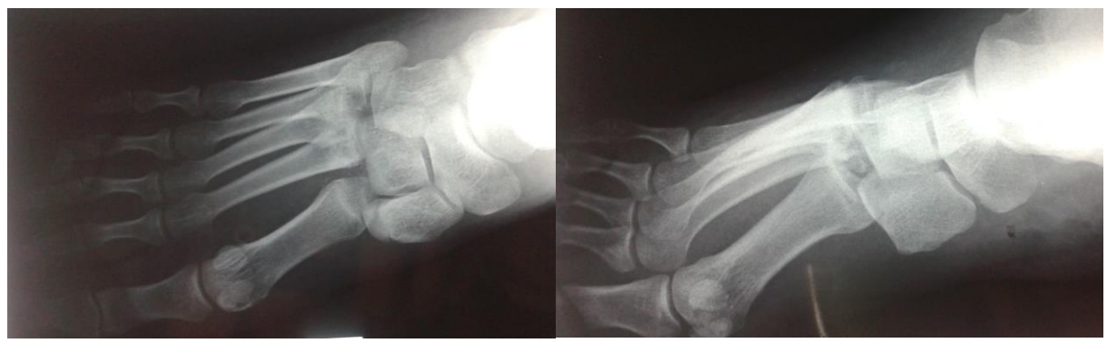
Fig-1: X-ray of a Fracture luxation of Lisfranc

The early complications are due to the violence of the traumas that give this type of fracture. We noticed: Six patients with multiple trauma (30%), 2 patients or 10% had associated bone fractures, represented by malleolar fractures. In our series, 20% of septic complications were reported. Nonunion is rare or even exceptional, according to the authors. We did not find any in our series. Vicious calluses can be seen after insufficient reduction and after secondary displacement, 2 cases were found or 10%.