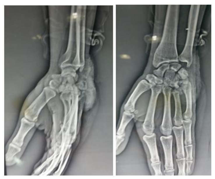
Fig-1: Face and profile X-ray showing a hamatum fracture associated with a fracture of the base of the 4th metacarpal