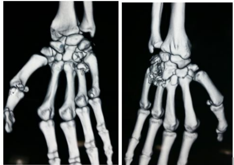
Fig-2: Wrist scanner to clarify lesions