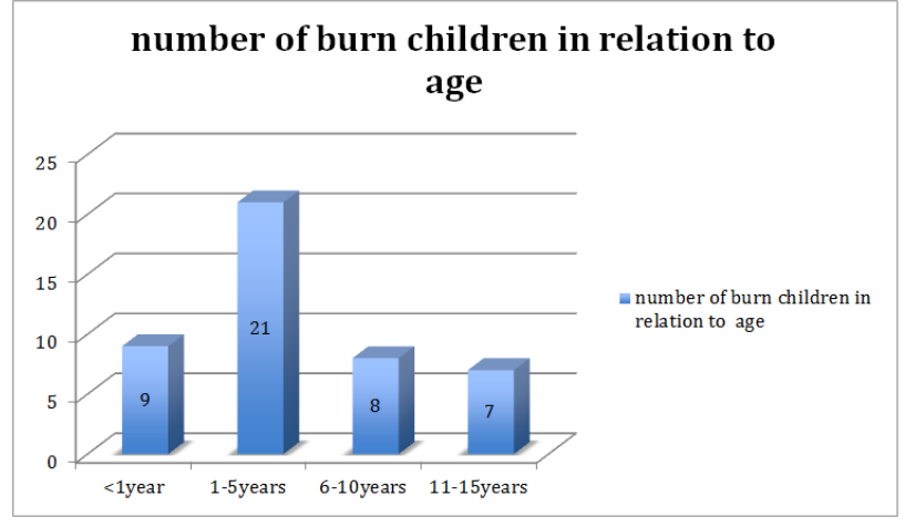
Fig-1: Number of burn children n relation to age

A male predominance (71.1%) is found with a sex ratio of 2.4 / 1. There is no significant difference in geographical origin (51.4% in urban areas vs. 48.6% in rural areas). The socioeconomic level is low in 87% of cases.