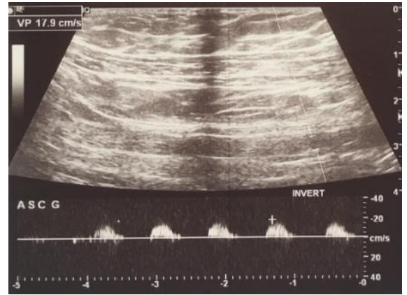
Fig-1: Reduced appearance of the caliber without parietal thickening of subclavian artery with spectrum buffering

Electrocardiogram, transthoracic echocardiography, troponin level and exercise testing were normal. Doppler ultrasound of the supra-aortic trunk and angio-MRI revealed a high-grade proximal subclavian stenosis releated to thrombosis. An oral anticoagulation with vitamin K antagonist was introduced with complete resolution of symptoms.