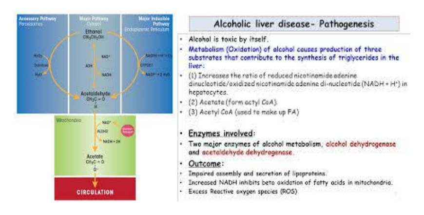
Anemia Is Due To-- 1. Alcohol Induced Decrease Absorption of Iron from Git. 2. Alcholic Liver Cirrohsis Follwed by Portal Hypertension Followed By Hyperspenism.