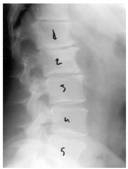
Fig-2: X-ray of lumbosacral spine showing lumbar spondylosis (lateral view)

A lack of data exists in this nation with respect to the careful job of IRR in the management of chronic low back pain. Because of absence of appropriate recovery numerous patients become for all time crippled. In this nation, whatever information is accessible yet it isn't adequate about restoration treatment on chronic low back pain because of lumbar spondylosis. Along these lines, the point of this study is to find out the impacts of infrared radiation (IRR) on the patients with chronic LBP due to lumbar spondylosis.