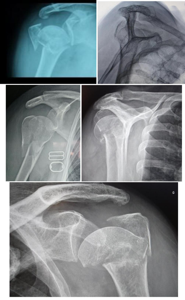
Fig-1: Standard double-exposure radiograph (face / profile) with three fragment fracture