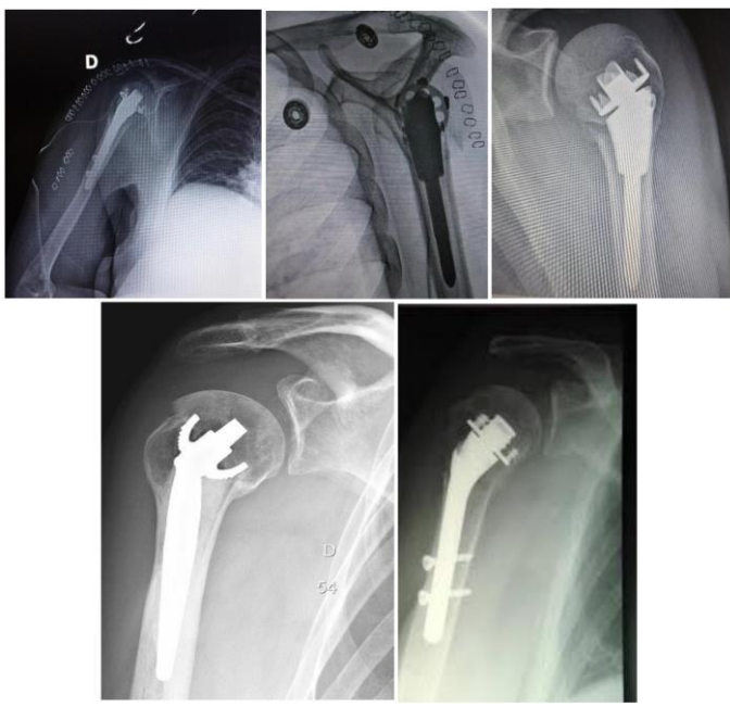
Fig-3: postoperative X-ray