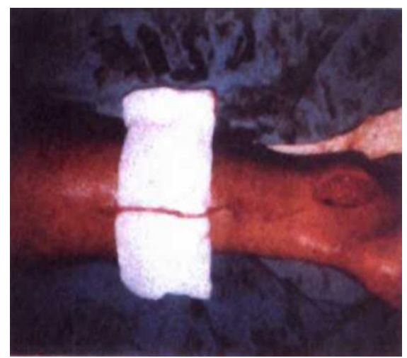
Fig-1: intraoperative image of a wound of the sciatic nerve

The mean follow-up was 12 months, during which the result was satisfactory in 50% of cases for Patients who received an EPS transplant. The result was good for patients who received palliative treatment, but the result was modest for the patient who benefited from suturing with neurolysis.