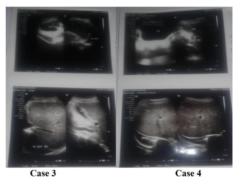
Fig-2: Ultrasonographic findings of Dengue Fever

1-15 years male and female patients with a history of fever diagnosed with dengue fever Ultrasound scan shows moderate free fluid in the peritoneal cavity surrounding urinary bladder and gallbladder wall thickening and pleural effusion. Later serology confirmed diagnosis of dengue (Figure-2).