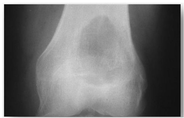
Fig-2: X-ray of aneurysmal cyst of the distal femur