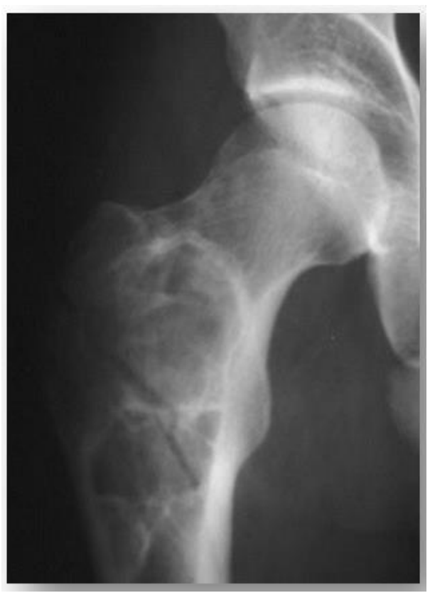
Fig-1: Radiograph of an essential bone cyst of the superior femoral metaphysic

Surgical treatment consists of curettage-filling: all the essential cysts of our series have been curetted and grafted. Osteosynthesis was done in two cases (Figure-4). Aneurysmal bone cysts were also curetted and grafted and osteosynthesis was done in one case only. In the short term, the evolution was good in all patients; none of our patients had thromboembolic complications or postoperative pathological fractures. In the long term none of our patients had recurrences. 3 patients in our series are lost to follow-up.