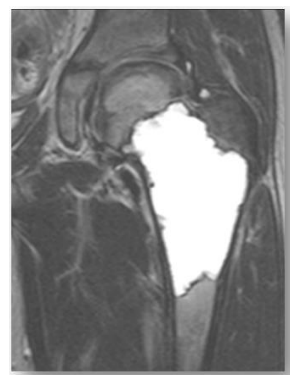
Fig-5: MRI of an essential bone cyst of the proximal femur