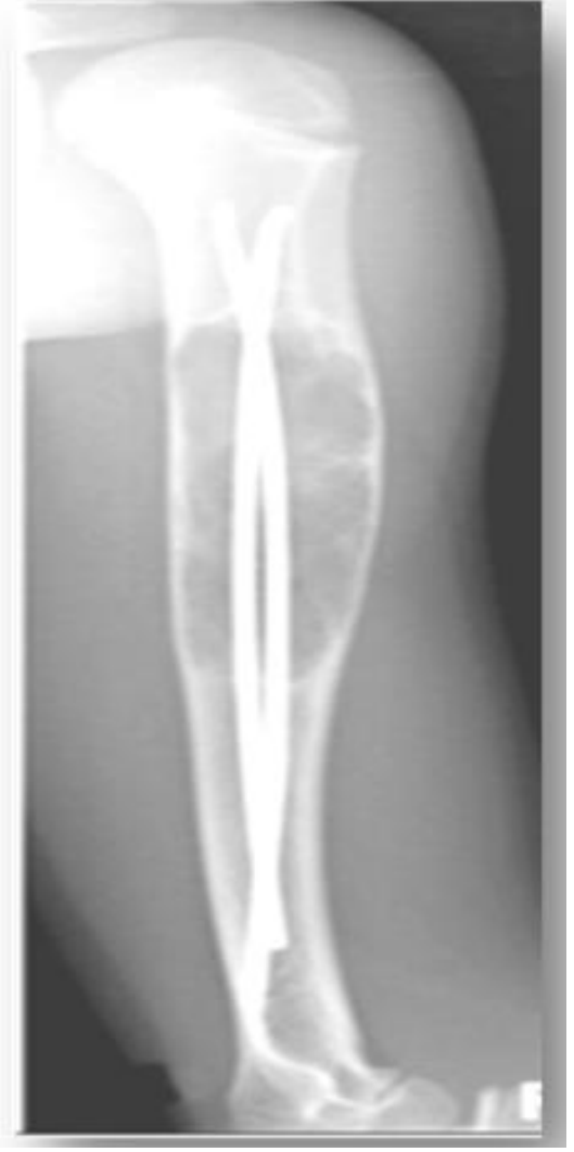
Fig-4: X-ray of a stable elastic centromedullary nailing of an essential bone cyst