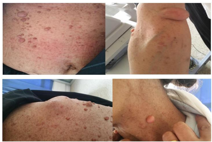
Fig-2: Multiple neurofibromas with milk coffee stains

The brain scan is performed in search of a glioma of the optic nerve, The dosage of catecholamines and metanephrines are normal. She has had several surgical ablations of neurofibromas. The social and psychological impact is very important, the patient refuses to marry, and is always struggling to find a job.