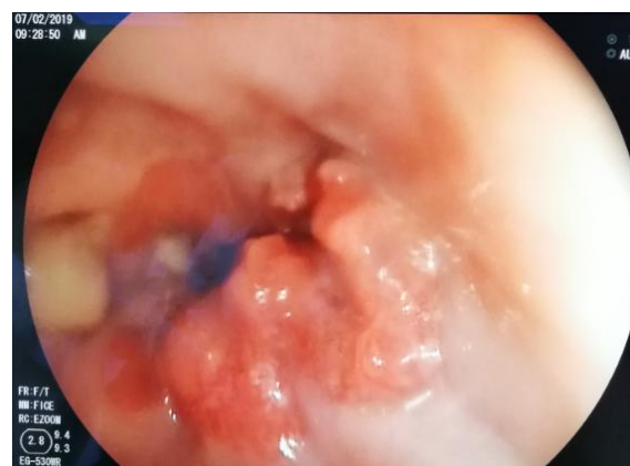
Fig-1: Process esophageal endoscopic

found a patient eupneique, apyretique, stable in hemodynamic terms with good condition général(oms=0,IMC à 21.7 kg/m 2 ). The somatic exam was without characteristics. The oesogastroduodenale (FOGD) fibroscopy objectified a tumor process of the lower esophagus CD-budding extended between 30 to 39 cm of dental arches (AD), range (Figure 1).