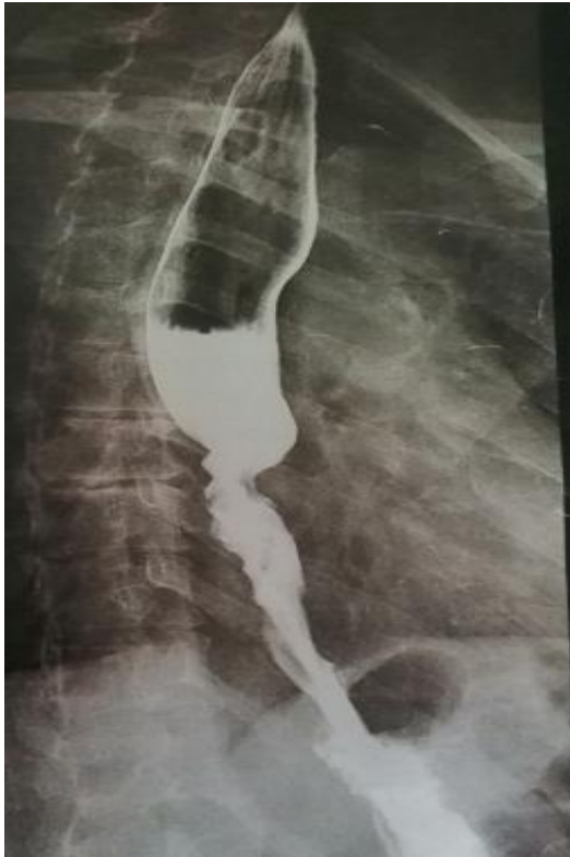
Fig-5: Transit oesogastrodeodenal showing a stenosis in Apple core