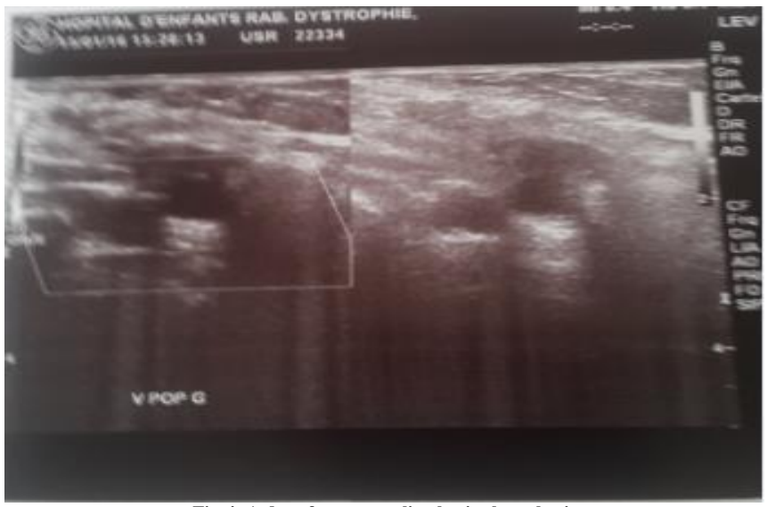
Fig-4: A deep femoro-popliteal vein thrombosis

12/8, SpO2 at 100% under 2l, without hemorrhagic complications. The etiological assessment revealed a deep femoro-popliteal vein thrombosis (Figure-4). The rest of the etiological record was without particularity. The patient was discharged under antivitamin-K, referred to internal medical consultation for follow-up.