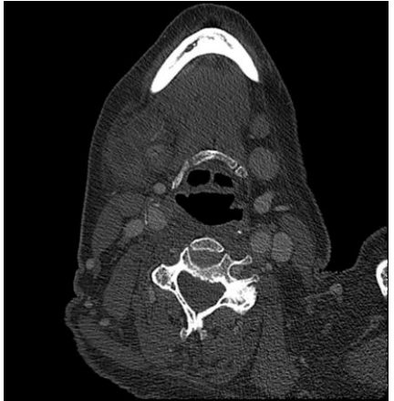
Fig-3: Craniofacial CT

A craniofacial CT scan did not exhibit local extension of the tumor (Figure 3).