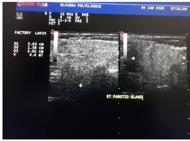
Fig-2: 24 years female, right parotid gland volume 4.4 ml (2.43x1.58x2.01cm)

Further studies should be done adding other patient's factors (height, weight, BMI) for more accurate results.