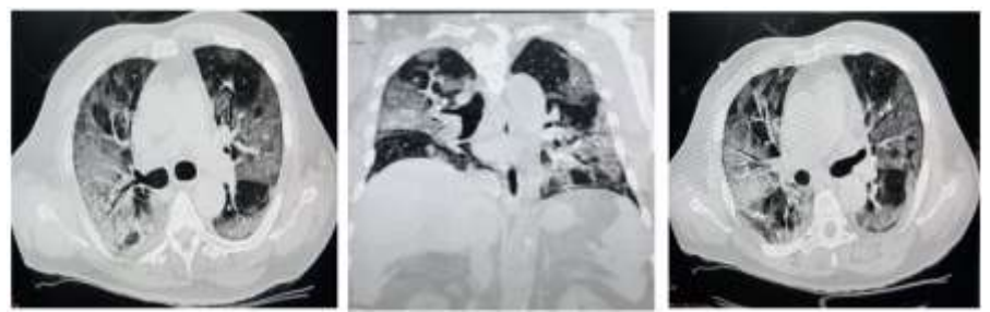
Fig-4: A 58 year old male patient presented with severe respiratory distress. HRCT of chest shows ground glass opacities with mosaic attenuation and areas of consolidation in both lungs.

© 2020 Scholars Journal of Applied Medical Sciences | Published by SAS Publishers, India