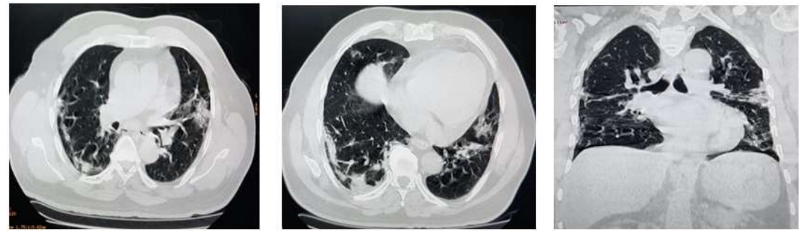
Fig-5: A 40 year old male patient presented with chest pain. HRCT of chest shows bilateral patchy areas of consolidation, ground glass opacities and sub pleural bands.