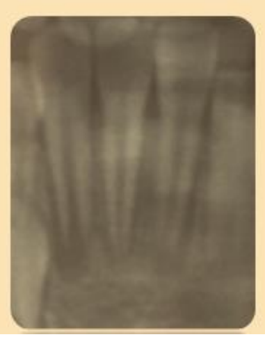
Fig-3: Retro alveolar radiograph