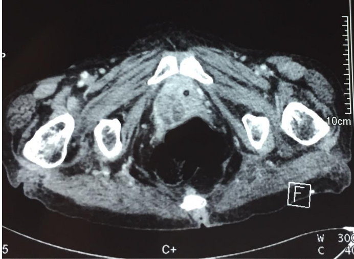
Fig-1: Axial CT urogram section demonstrated a soft tissue along of the urethra