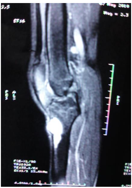
Fig-2: MRI of the knee shows the hyper-signal appearance of the anterior tibial tuberosity in T 1