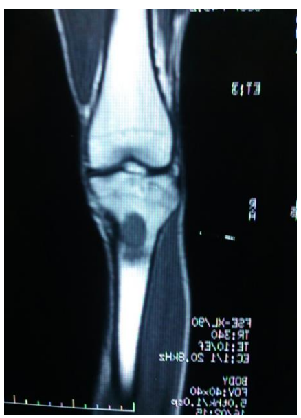
Fig-2: MRI of the knee shows the hyper-signal appearance of the anterior tibial tuberosity in T2