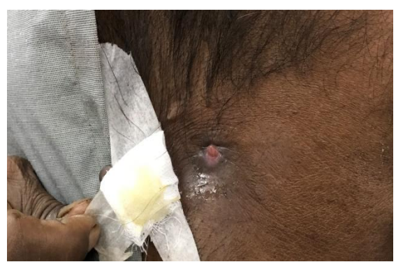
Fig-1: Lesion seen in the chest wall