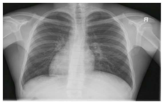
Fig-2: Normal CXR