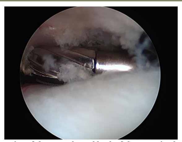
Fig-4: Resection of the anterolateral beak of the acromion by a shaver