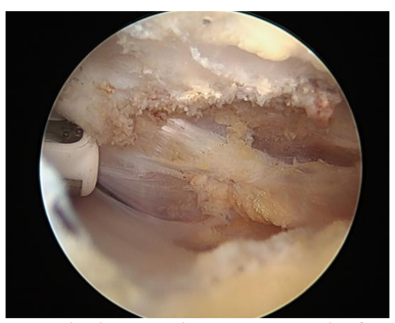
Fig-3: Detachment of the coracoacromial ligament with electrocoagulation from the antero-lateral edge of the acromion