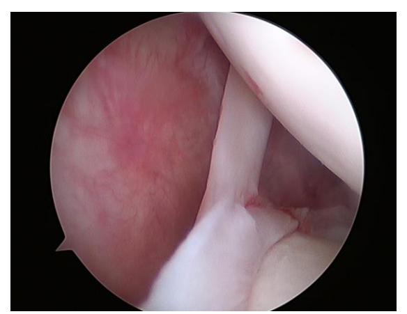
Fig-1: Exploration of the glenohumeral joint

comparing the average U.C.L.A. score before and after the procedure, we noted an increase in the score from 11.5 to 30.5, indicating an improvement in the functional status of our patients. All our patients were painful before the operation, all our patients were relieved, 22 totally and five partially. In our study, no septic or arthritic complications were noted.