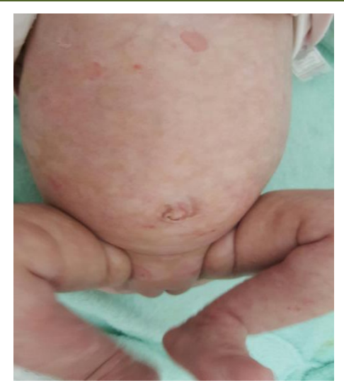
Fig-4: Complete whitening after treatment with intravenous immunoglobulin