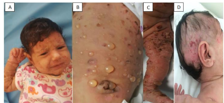
Fig-1: Vesicles-blisters with clear or haemorrhagic contents + post-bullous erosions, A: lesions of the face, palmar and upper limb, B: trunk lesions, C: acral lesions and genital mucosa, D: damage to the scalp

The parents do notchoose to vaccinate their daughter even though they were informed of the absence of contraindications to continue the vaccination schedule.