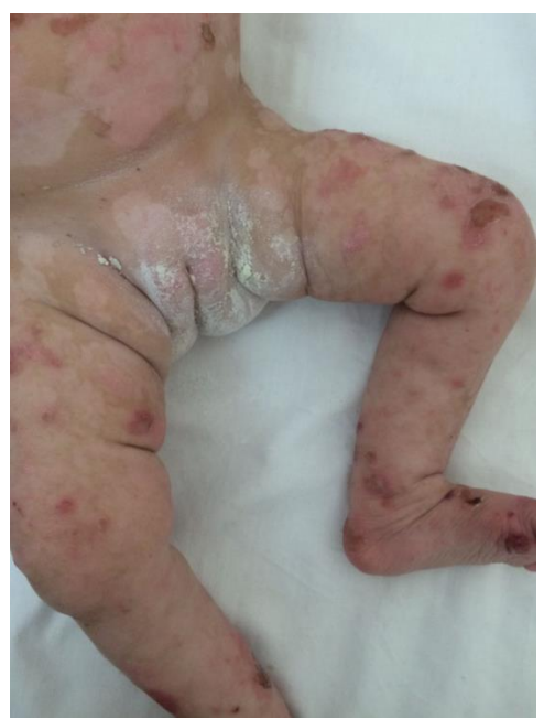
Fig-3: Early healing of bullous lesions after corticosteroid therapy at the cost of hypopigmented macules

© 2019 Scholars Journal of Applied Medical Sciences | Published by SAS Publishers, India