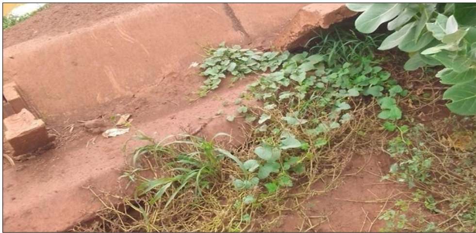
Figure 2 : condition of a portion of the main canal at the Aneker irrigated perimeter

The water distribution works are in poor condition, especially the primary and secondary canals which are currently in various degraded states. The main canals present anomalies, most of which are either broken, detached, loose, cracked or good as illustrated in Figure 2.