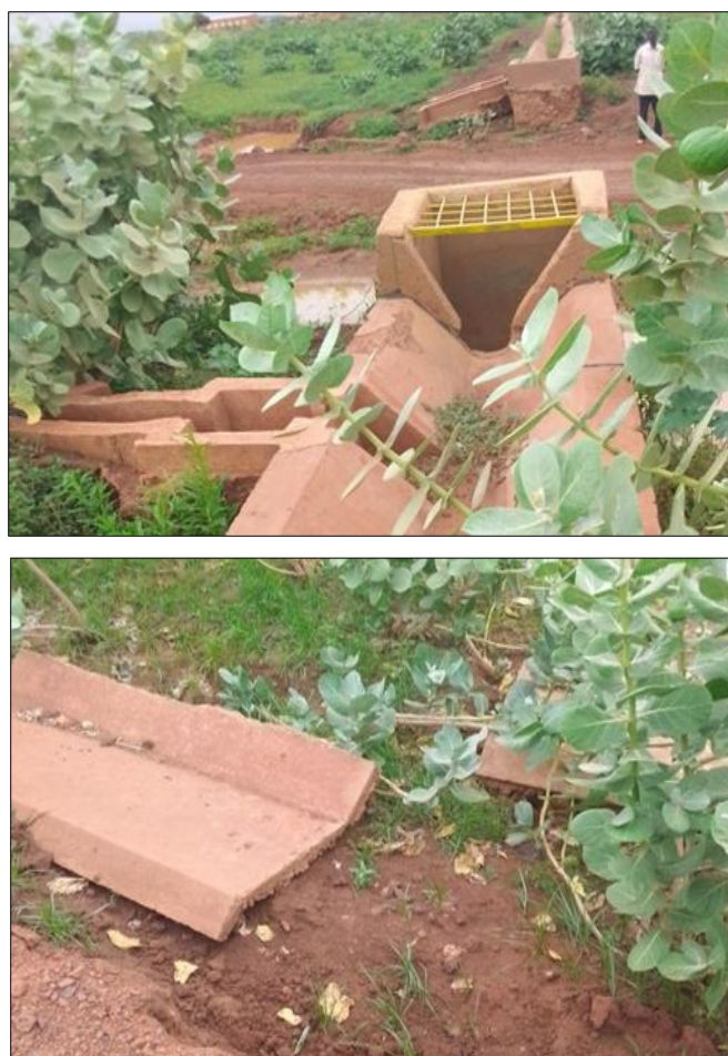
Figure 3 : Condition of secondary canals in the Aneker irrigated perimeter

The table below shows on the secondary canals the constraints mainly observed are cracking, weeding, defective seals and the degradation of the valves to a very