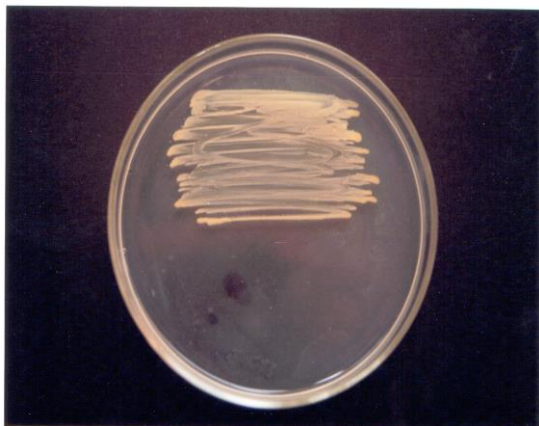
Fig-2: Forty-eight hr old growth of S. aureus on nutrient agar at 37°C, isolated from milk of a 8-year-old mastitic cow.