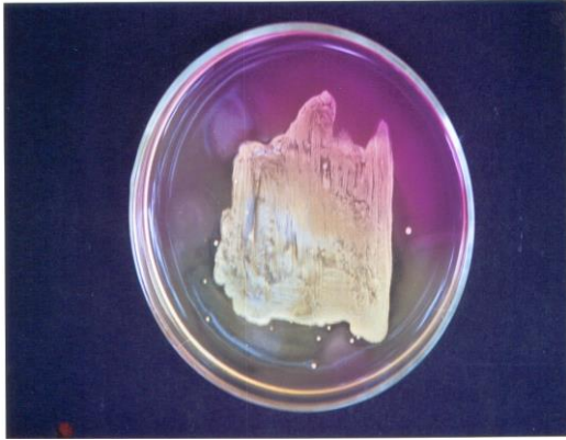
Fig-1: Staphylococcus aureus cultured in pure and luxuriant growth from the cutaneous lesions of a 10-year-old girl on Mannitol Salt Agar at 37° C.