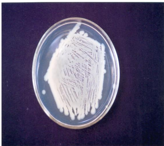
Fig-3: Forty-eight hr old growth of S. aureus on nutrient agar at 37°C, isolated from a 5-year-old male dog with otitis