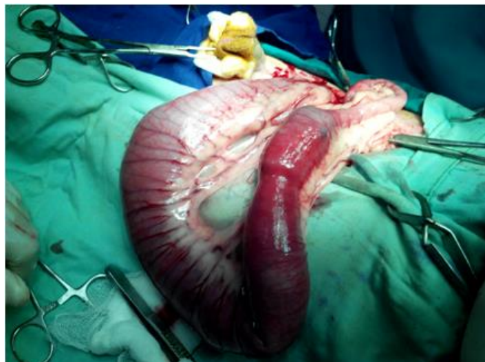
Fig-2: Photograph showing obstruction of foreign body at caudal jejunum