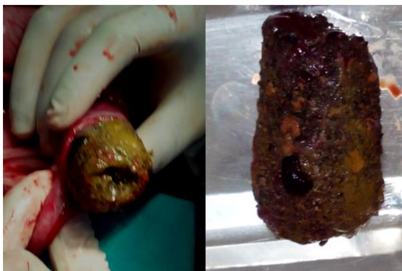
Fig-3: Photograph showing removal of maize corn from the caudal jejunum