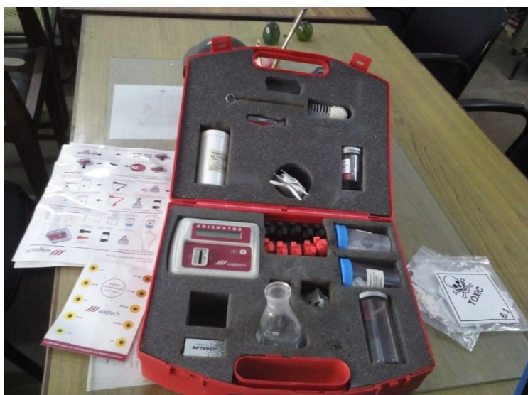
Fig 1: Wagtech International digital arsenator

Estimation of Arsenic in the water was done using the digital arsenator developed by “Wagtech International” (Figure: 1). Detection range of the instrument is between 1 ppb (Parts per Billion) to 500 ppb.