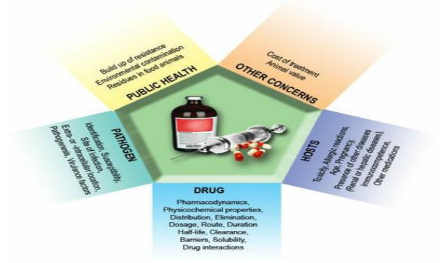
Non therapeutic use in food animals

The continuously increasing world demand for animal protein has led to increasingly efficient intensive farming systems where animals are raised to maximize the amount of utilizable product at the least cost. High stocking densities and rapid animal growth, coupled with the reduction of available agricultural space, can sometimes facilitate the transmission of infectious agents and the susceptibility of the animals to infectious diseases. It has long been established that antimicbrobials (antibiotics) may help improve production and prevent disease; for this reason, food animal producers utilize antibiotics for non-therapeutic purposes. These uses are generally referred to as nontherapeutic applications of antimicrobials; of which there are two main categories: use of antimicrobial (antibiotics) in animals for growth promotion and Use of antimicrobial (antibiotics) in animals for prophylaxis and metaphylaxis [7].