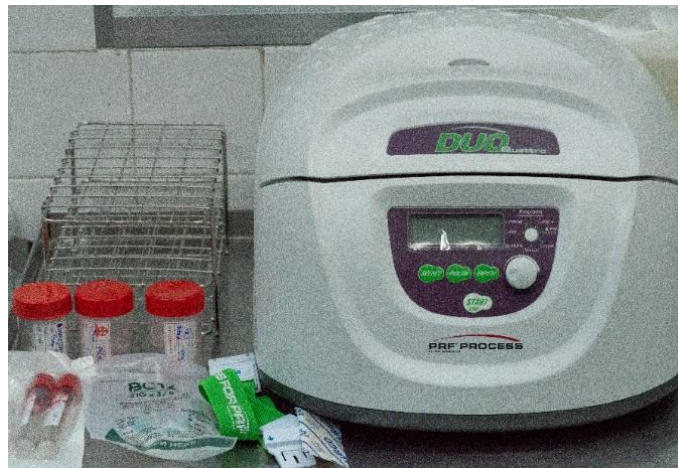
Figure 2: Dou Quattro PRF system (Process for PRF, Nice, France)

20ml blood samples of patients were taken into two 10ml glass-coated tubes. Blood centrifugations were performed with A-PRF+ mode (1300rpm within 8 minutes) of the Dou Quattro PRF system (Process for PRF, Nice, France) (Figure 2). After centrifugation, the PRF clots were dissected from the red blood cells (Figure 3).