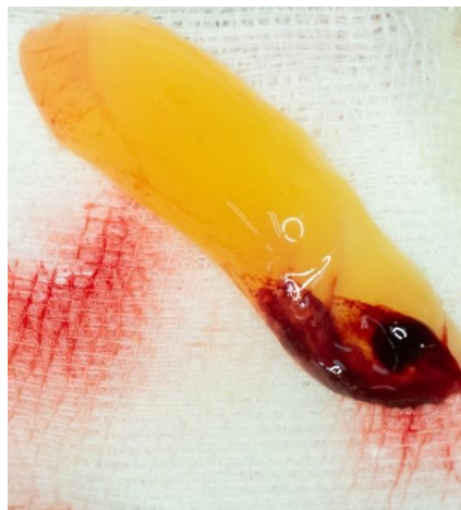
Figure 3: A-PRF+ clot after preparation and dissection