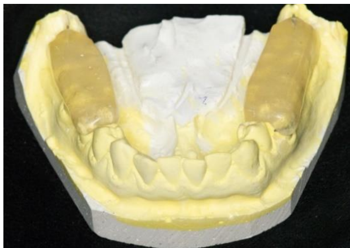
Figure 1: Occlusal stent with mandibular impression

Mandibular impressions were taken to make occlusal stents to ensure consistency of positions between measurements. Each stent was 2mm thick covering the occlusal surfaces from the second premolar to the second molar. At the distal surface of the second molar, the stent was extended 4mm apically from occlusal surfaces. During polymerization, grooves were made on the distal buccal and distal lingual of the stent at the second molar position. Consequently, distal buccal and lingual grooves were 6mm in length. A 5mm metal wire was also inserted into the distal surface of the stent to assess alveolar bone height evaluation according to the proportion on periapical radiographs (Figure 1).