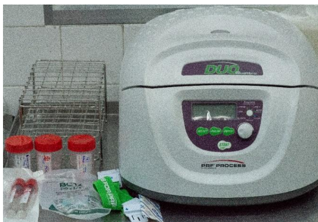
Figure 2: Dou Quattro PRF system (Process for PRF, Nice, France)

20ml blood samples of patients were taken into two 10ml glass-coated tubes. Blood centrifugations were performed with A-PRF+ mode (1300rpm within 8 minutes) of the Dou Quattro PRF system (Process for PRF, Nice, France) (Figure 2). After centrifugation, the PRF clots were dissected from the red blood cells (Figure 3).