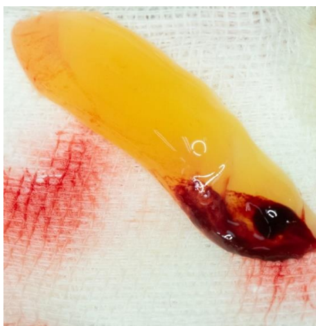
Figure 3: A-PRF+ clot after preparation and dissection