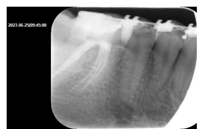
Figure 3b: Follow up 20 months post-op tooth 46: horizontal x-ray with 20 degrees mesial angulated shift (notice the MM canal joining ML canal -SLOB technique) xray cone cut distally.