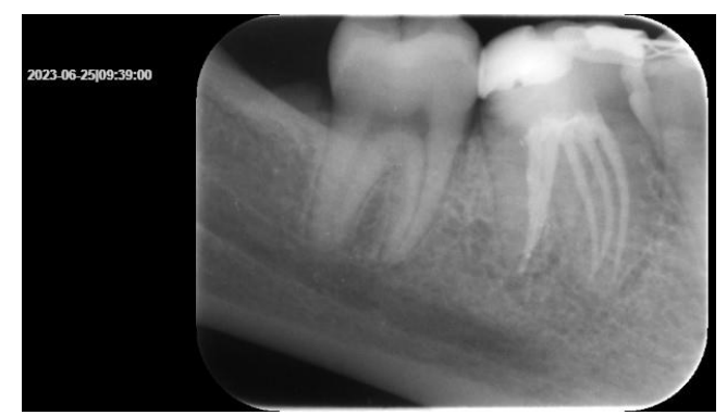
Figure 3a: Follow-up 20 months post-op tooth 46: horizontal x-ray with 20 degrees distal angulated shift (notice the MM canal joining ML canal- SLOB technique)