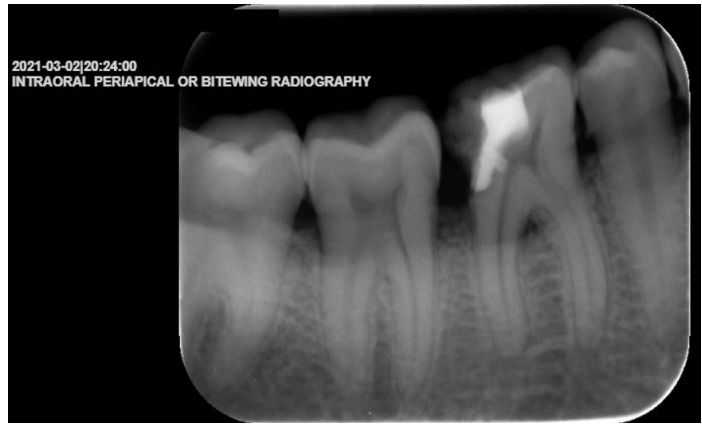
Figure 10: Pre-op x-ray tooth 46

and troughing between the mesiobuccal and mesio lingual canal orifices, the middle mesial (MM) canal orifice was identified, and the canal was subsequently negotiated. The working lengths of MB, MM, ML, DB, and DL canals were 21.5, 23, 23, 20, and 20 mm, respectively (5 separate canal orifices). All root canals were shaped with rotary files according to the manufacturer's instructions. Continuous irrigation of 5.25% sodium hypochlorite was performed during the procedure, the root canals were dried, and calcium hydroxide was used as medication in between appointments, access was sealed with a temporary filling. On the second visit, the tooth was asymptomatic. A final irrigation protocol was performed with 17% EDTA and 5.25% sodium hypochlorite. The root canals were dried with paper points and the final root canal filling was performed with cold lateral compaction guttapercha technique and a resin-based sealer. Post obturation x-ray at distal angulation taken (MM canal joining MB canal and apically MB ML canals joining, distal canals joining apically) (Figure 11). The tooth was restored with composite restoration and the patient experienced no postoperative sequelae. A radiographic 27-month follow-up (Figure12a,12b) showed no periapical lesions, no secondary decay or fractures, and the tooth remained asymptomatic. The patient's tooth 46 also had a crown prosthesis as advised and the tooth was functional.