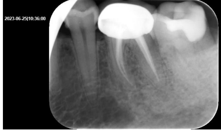
Figure 6a: Follow-up 23-month post-op x-ray tooth 36: mesial angulated x-ray

Raymol Manoj Varghese., Sch J Dent Sci, Jul, 2023; 10(7): 133-144