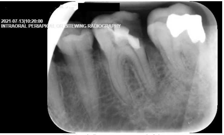
Figure 4: Pre-op x-ray tooth 36

Raymol Manoj Varghese., Sch J Dent Sci, Jul, 2023; 10(7): 133-144 buccal (DB), and disto lingual (DL) were negotiated until the working length (working length was determined with an electronic apex locator verified with x-rays) initially with 6,8,10 K files and rotary path files (mesial canals were narrow). The developmental groove between the mesio lingual (ML) and mesio buccal (MB) canals was further evaluated and explored with a DG16 endodontic explorer and an additional orifice was identified and located near the MB canal. The working lengths of MB, MM, ML, DB, and DL canals were 21, 21, 21, 21, and 21 mm, respectively (5 separate canal orifices). Canals shaping was done with rotary endodontic files up to size 25 in mesial and 30 size in distal. The root canals were disinfected with copious irrigation of 3% sodium hypochlorite and EDTA 17% solution, and a calcium hydroxide dressing was placed, cavity was sealed with a sterile cotton pellet under temporary filling. On the second visit, the tooth was asymptomatic, the root canal obturation was completed with resin sealer and cold lateral compaction guttapercha technique. Post obturation distal angulated x-ray was taken, the MM canal was joining the MB canal, and the distal canals also joined apically (Figure 5). The 23-month follow-up showed no clinical or radiographic pathological findings, a crown prosthesis was seen, and the tooth is functional (Figure 6a, 6b).