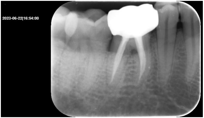
Figure 12a: 27-month follow-up mesial shift x-ray 46