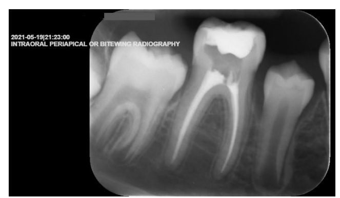
Figure 8b: Immediate post-op radiograph of tooth 46 with no angulation