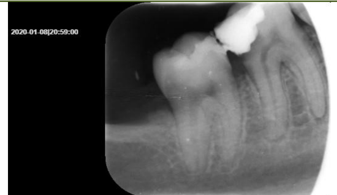
Figure 1: Pre-operative periapical radiograph tooth 46 showing defective temporary restoration.