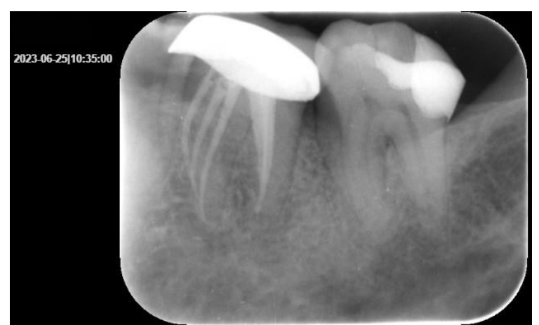
Figure 6b: Follow-up 23-month post-op tooth 36: distal angulated x-ray