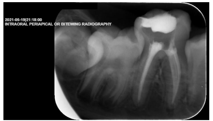
Figure 8a: Immediate post-op distal-angulated radiograph of tooth 46, presenting a Gulabivala Type 1 (3 -1) [12] mesial canal configuration and Vertucci Type2 (2-1) [11] in the distal canal configuration