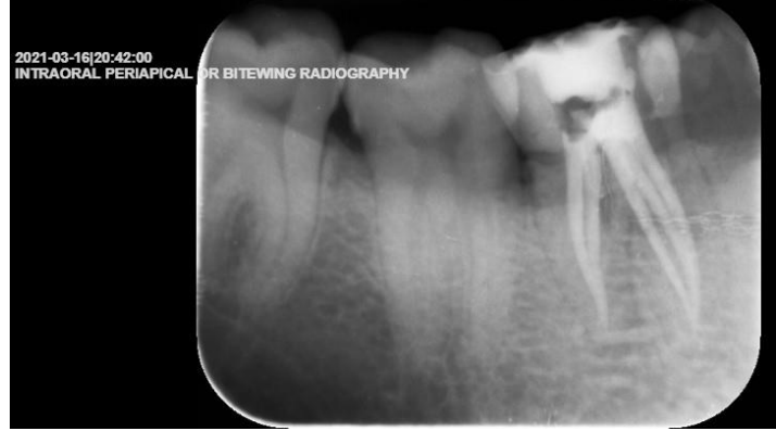
Figure 11: Immediate post-op distal shift x-ray tooth 46: Mesial canals configuration Al-Qudah AA Type XXII (3-2-1) [14] MM canal joining MB canal later MB & ML canals joining apically. Distal canals configuration (2-1): Vertucci [11] type 2