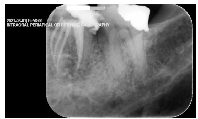
Figure 5: Immediate post-obturation tooth 36: distal shift x-ray. Mesial configuration (3-2) MM canal joining MB canal: Gulabivala Type II [12]/ Sert S type XV [13] . Distal canals configuration (2-1): Vertucci type 2 [11]