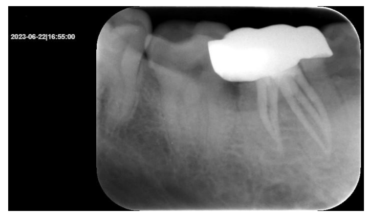
Figure 12b: 27-month follow-up distal shift x-ray 46