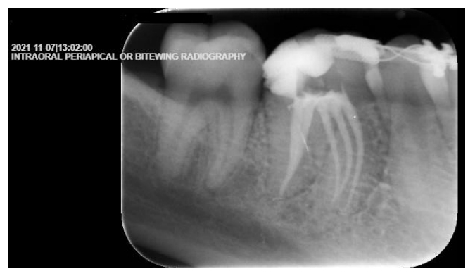
Figure 2: Immediate post-op distal oblique shift x-ray 46. Mesial configuration (3-2) MM canal joining ML canal: Gulabivala Type II [12]/ Sert S type XV [13]. Distal canals configuration (2-1): Vertucci type 2 [11]