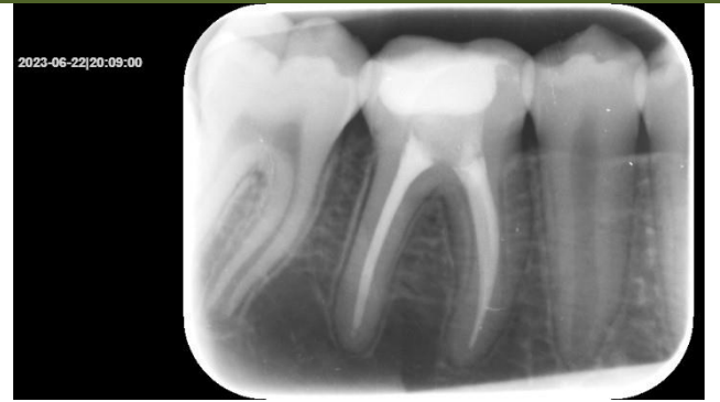
Figure 9b: 25-month follow-up radiograph of tooth 46 mesial angulated shift