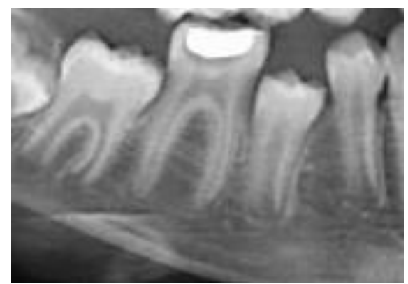
Figure 7: Pre-operative radiograph of tooth 46

presented, no periapical infection was noted, and clinically the tooth was asymptomatic and functional.